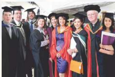
Six of eighteen SSEI Students in Social Enterprise sponsored by Flax Trust/America Graduate at The University of Ulster July 2013