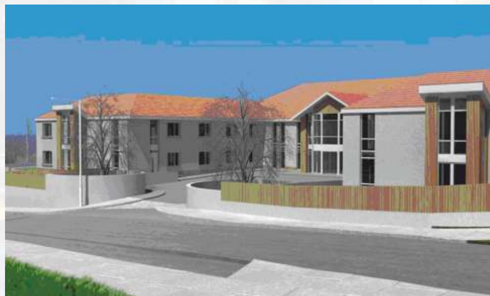
Proposed state of the art Nursing Home, EMI, Dementia Caring Facility

Twenty Third Annual New York Event The '21' Club, 21 West 52 Street, New York - October, 9th 2013