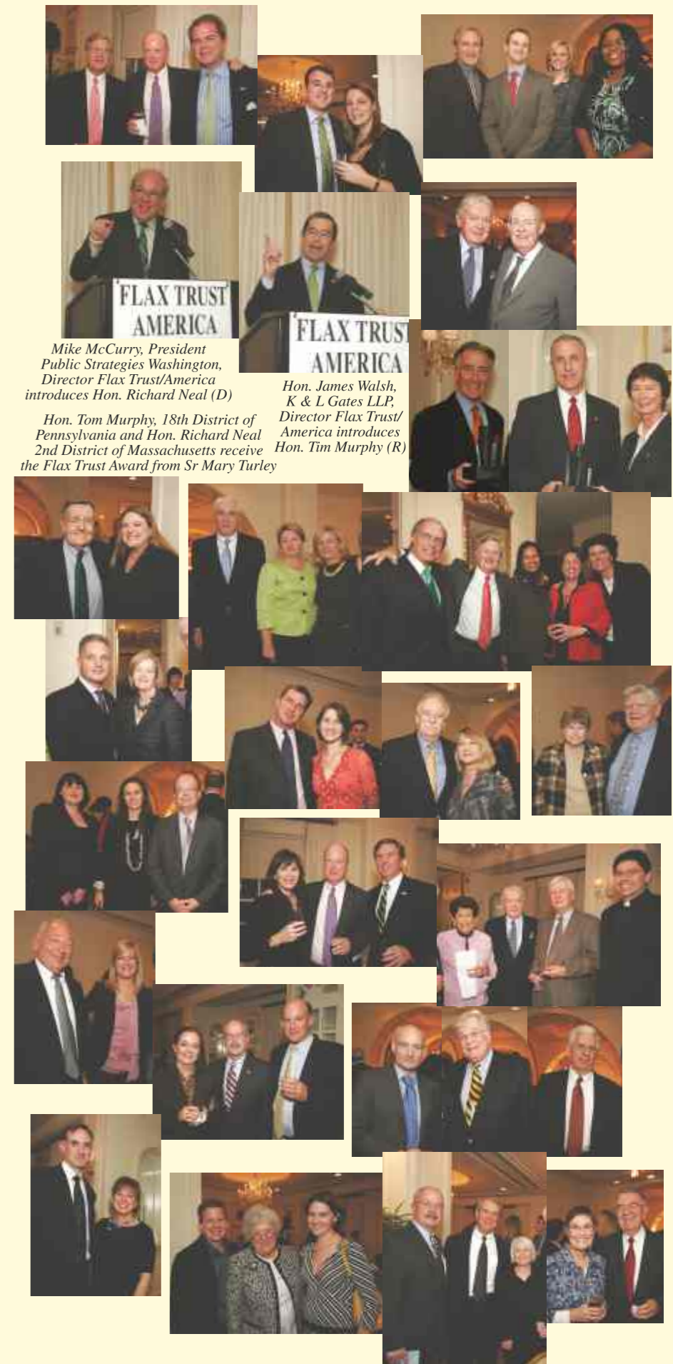
Mike McCurry, President Public Strategies Washington, Director Flax Trust/America introduces Hon. Richard Neal (D)