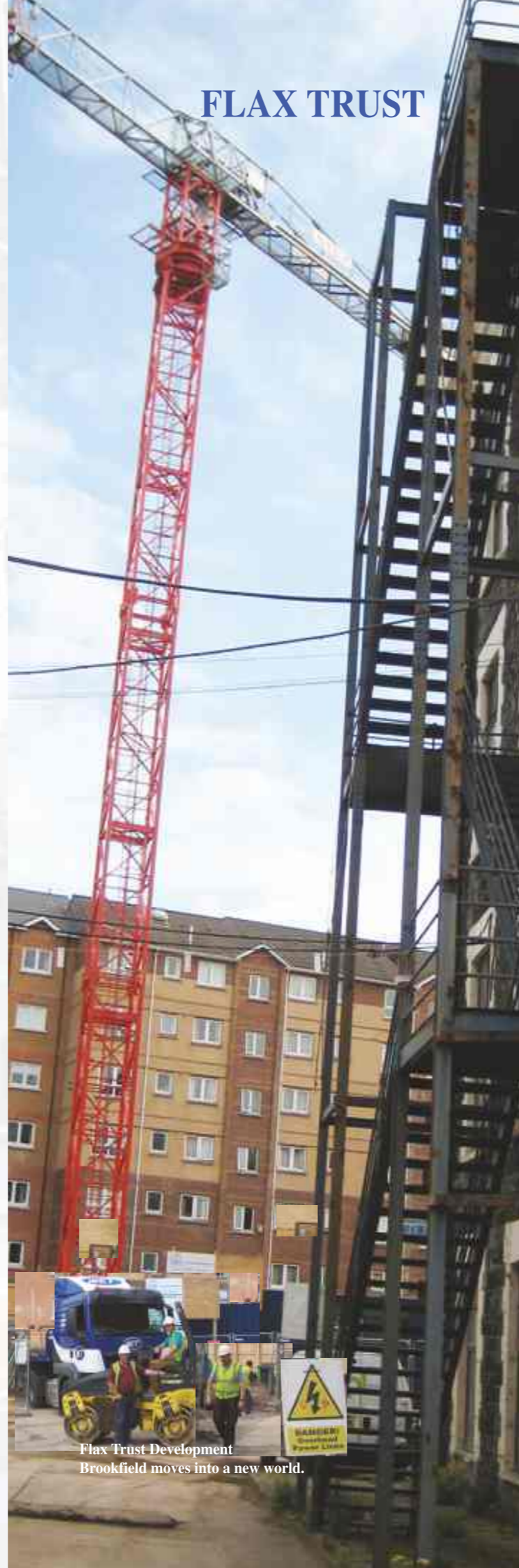
Flax Trust Development Brookfield moves into a new world.

We are very grateful to Mutual of America for this invaluable facility.