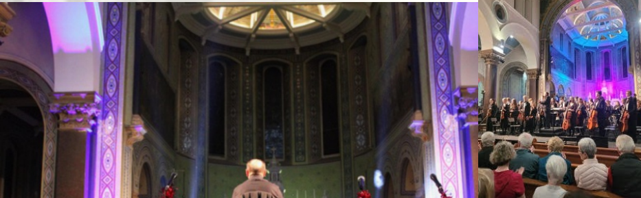
City of Belfast, Youth Orchestra (CYBO) at Holy Cross Church, North Belfast

Flax Trust Arts Bridges the Divide in North Belfast through Music and Theatre, encouraging Respect for Difference. The production of The Wonderful Wizard of Oz brought together 35 individuals aged 7 to 70, filming in locations such as Belfast City Centre, The Crumlin Road Gaol in North Belfast and Carrickfergus Castle.