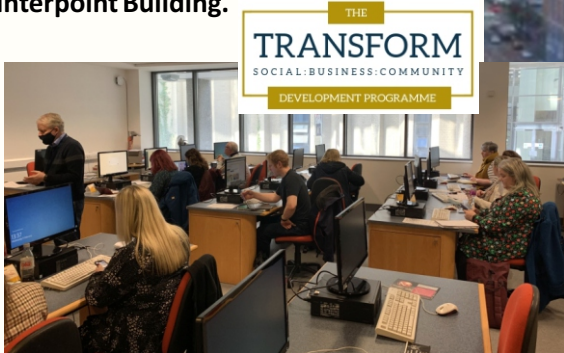
Transform Students in class

The new Ulster University Campus in Belfast City Centre, is a Flax Trust Dream come true on the original site of its Interpoint Building.