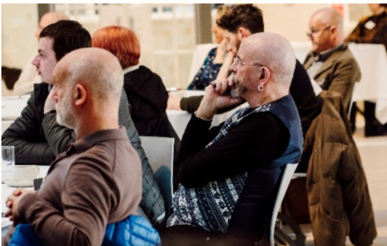
ADSE alumni with other representatives of the social economy at the event