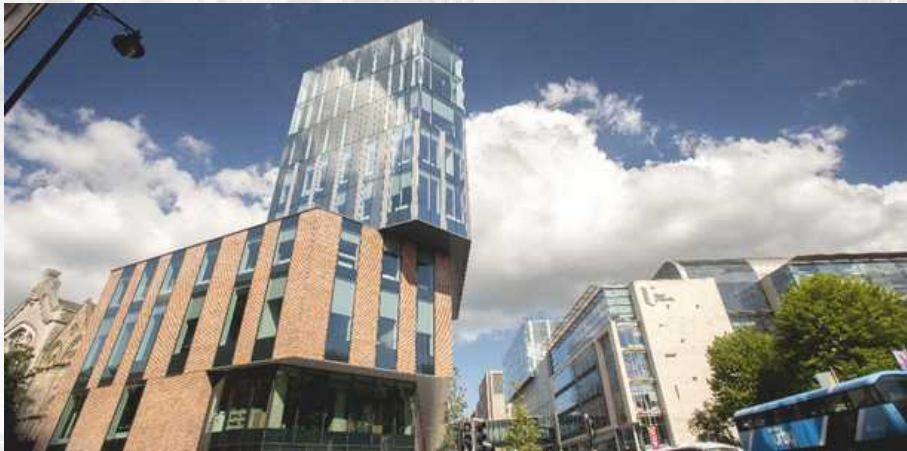
Ulster University, Belfast Campus

In 2024 Ulster University was named the UK and Ireland University of the Year, the first time a university on the island of Ireland has received the award.