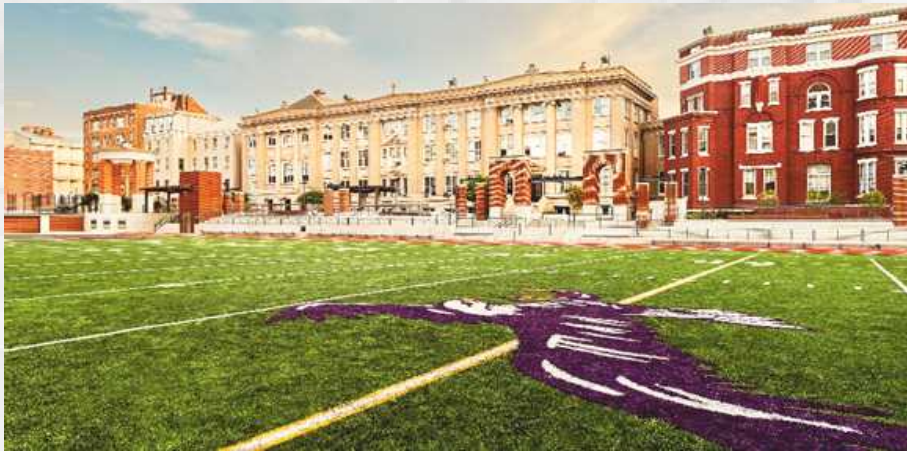
Gonzaga College High School, Eye Street Campus Washington D.C.

Gonzaga College, founded in 1821, is a top-rated private college offering a values – orientated and academically challenging curriculum to young men of diverse backgrounds.