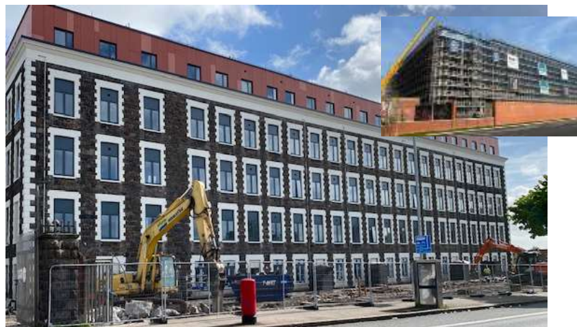
New Life for Brookfield Mill – Town Houses and Apartments. The old mill building contains 55 apartments and an additional 22 town houses.