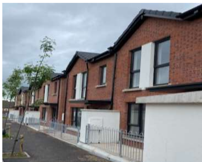
The Galgani development consists of 53 new affordable housing units of which 29 are houses, 24 apartments and 5 retail units