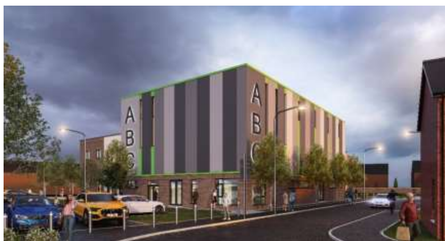
Flax Trust is working in collaboration with ABC Trust and Urban Villages to develop this Community Regeneration project providing health, recreational and training facilities and an arts centre.