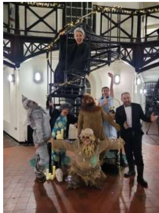
Flax Trust Arts production of the Wizard of Oz performed in the Crumlin Road Jail